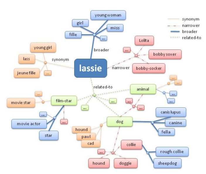
Figure 3. One possible thesaurus network for the term 'lassie'

Fig. 3 shows an example thesaurus network for the term 'Lassie'. The displayed nodes can be seen as valid answers to the cloze exercise 'Lassie is a ...'. These semantic relations of a thesaurus extend the principles of simple cloze exercises to semantic cloze exercises where not only the syntax is being checked but also the semantics of the given answers. This can lead the way to intelligent e-learning systems which mimic the expert knowledge of a human tutor. Like human teachers the intelligent e-tutor systems must be able to meet the thinking of the students and accept phrases for the cloze exercises which go beyond a simple text matching and incorporate the meaning of the answer as well.